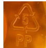
#5 All other items labeled #5