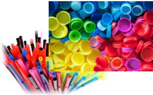
#5 Straws and Lids (If lids or caps do not have a # they go in # 5)