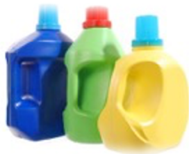
#2 Coloreds Bottles and Jugs