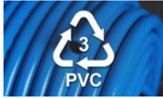
#3 Only items with this label