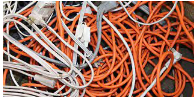
Cords and Wires