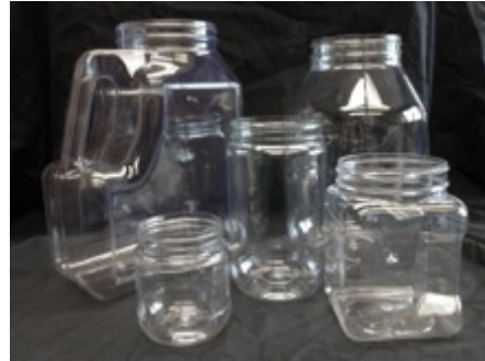
#1 Clear (see through) PET or PETE