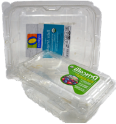
#1 Clear (see through) Clamshells (Can be considered clamshell if lid was once molded together) * Not all clamshells are #1 remember to check.