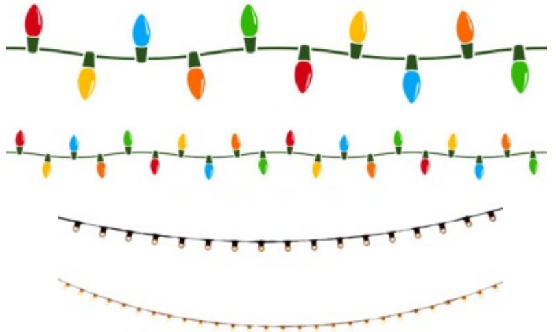
Holiday and String Lights