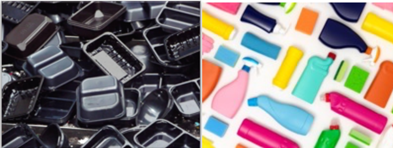
#1 Colored PET or PETE