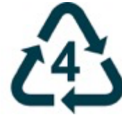
#4 All items labeled #4 other than plastic film