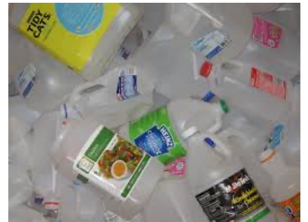
#2 Clear (see through) Bottles and Jugs