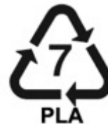
#7 Only items labeled as PLA Compostable/Biodegradable